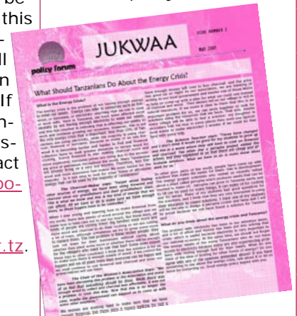
Jukwaa is one of the publications launched in April